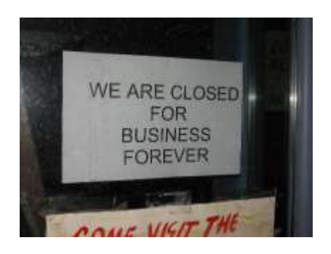
Loss of Job